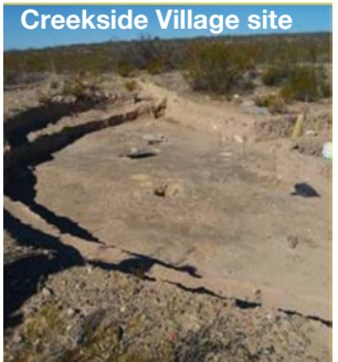
Creekside Village site

The Jornada Mogollon traveled into the Tularosa Basin area and abandoned their villages approximately 600 to 700 years ago. Through its work, the Institute has established the Creekside site contains pit houses, a kiva and irrigation ditches. The first lecture dealt with the processes of excavation and the results of the research. Greenwald plans two more lectures at the Artspace about the work at Creekside Village, one December 17: "Settlement Complexity of Tularosa Canyon during the Mesilla Phase", a focus on how the various irrigation communities managed the Rio Tularosa and examine the roles of the various great kivas now identified. In the January 21st lecture, Matt Cuba, HAFB CulturalResource Manager will present on "Gypsum Overlook: A Structural Early Archaic Site", a site on WSMR just north of WSNP boundary. Consider supporting JRI by joining. Go to the website: jornadaresearchinstitute.org . JRI will continue excavations in their sites in the Basin during the winter months. Join and participate in the excavations.