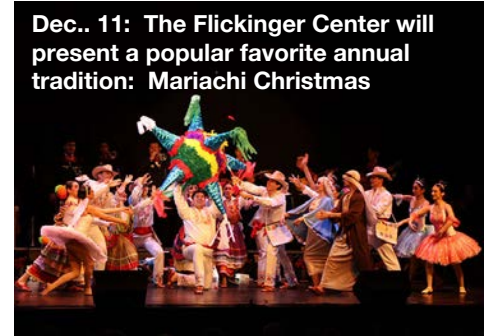
Dec.. 11: The Flickinger Center will present a popular favorite annual tradition: Mariachi Christmas